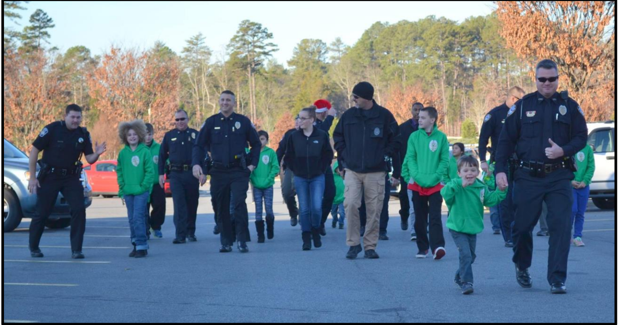
Smiles And Thumbs Up As Everyone Gets Ready To Shop