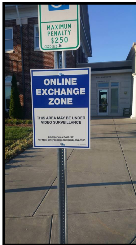
Online Exchange Zone Now Located In Front Of Locust Government Center