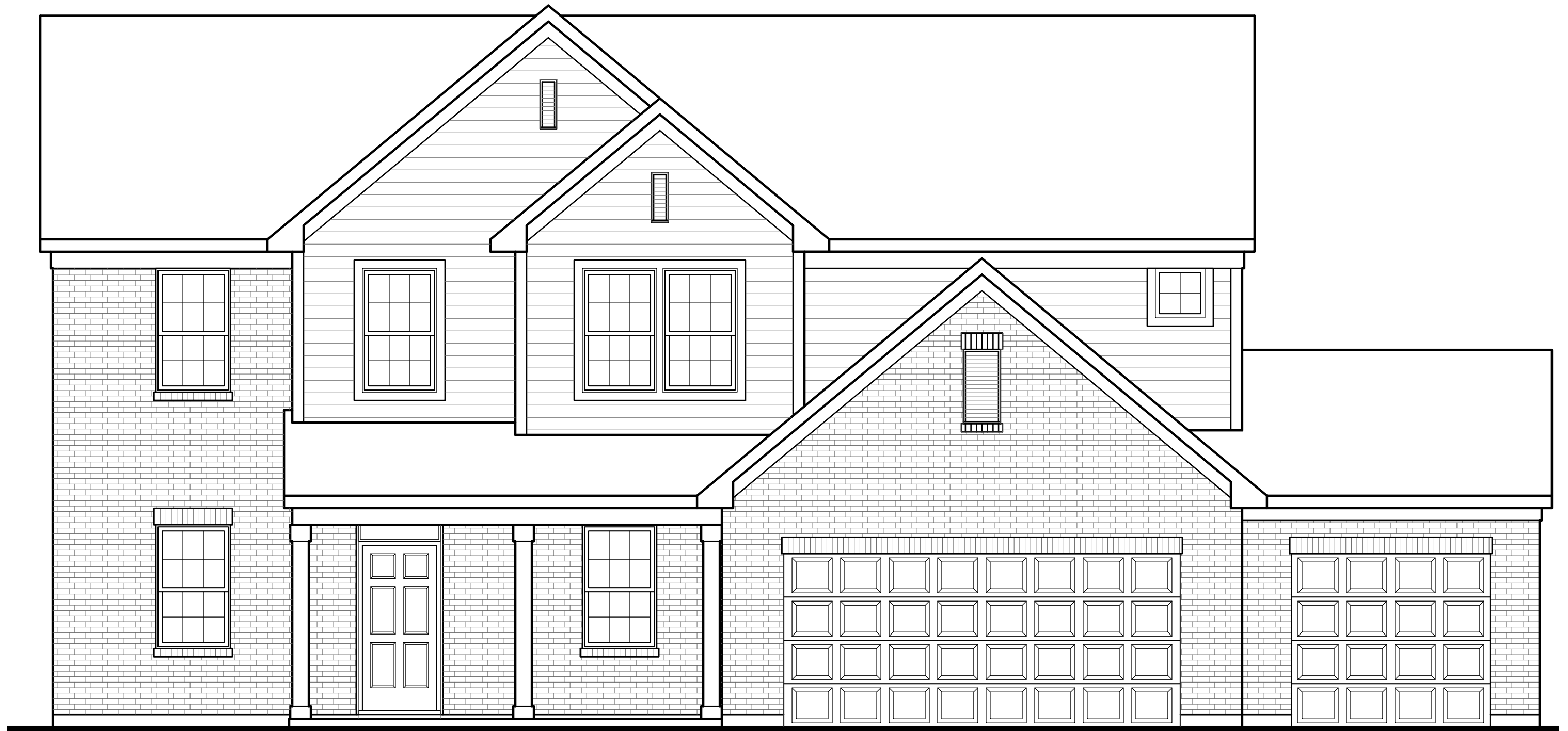
STOCKTON "E" TRADITIONAL CARRIAGE GARAGE