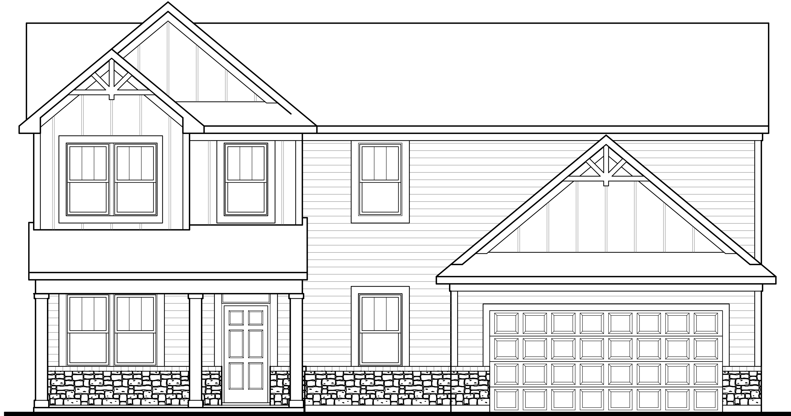
BRISTOL "C" FARMHOUSE