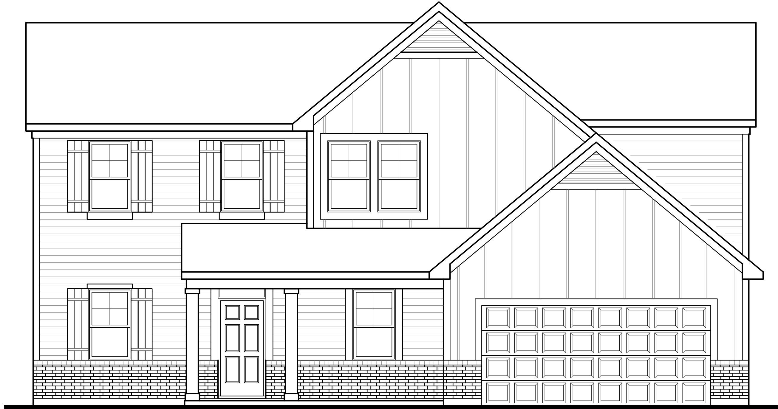
BRISTOL "B" FARMHOUSE