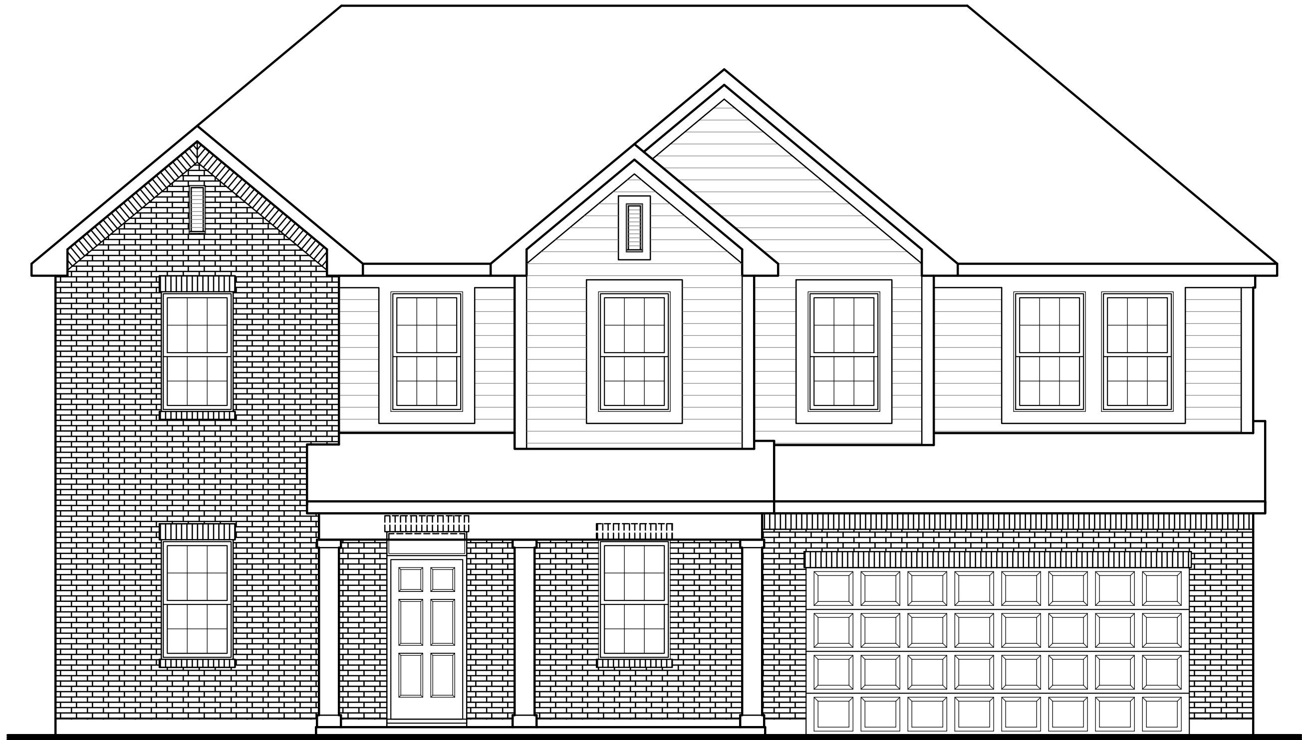
DICKINSON "E" TRADITIONAL