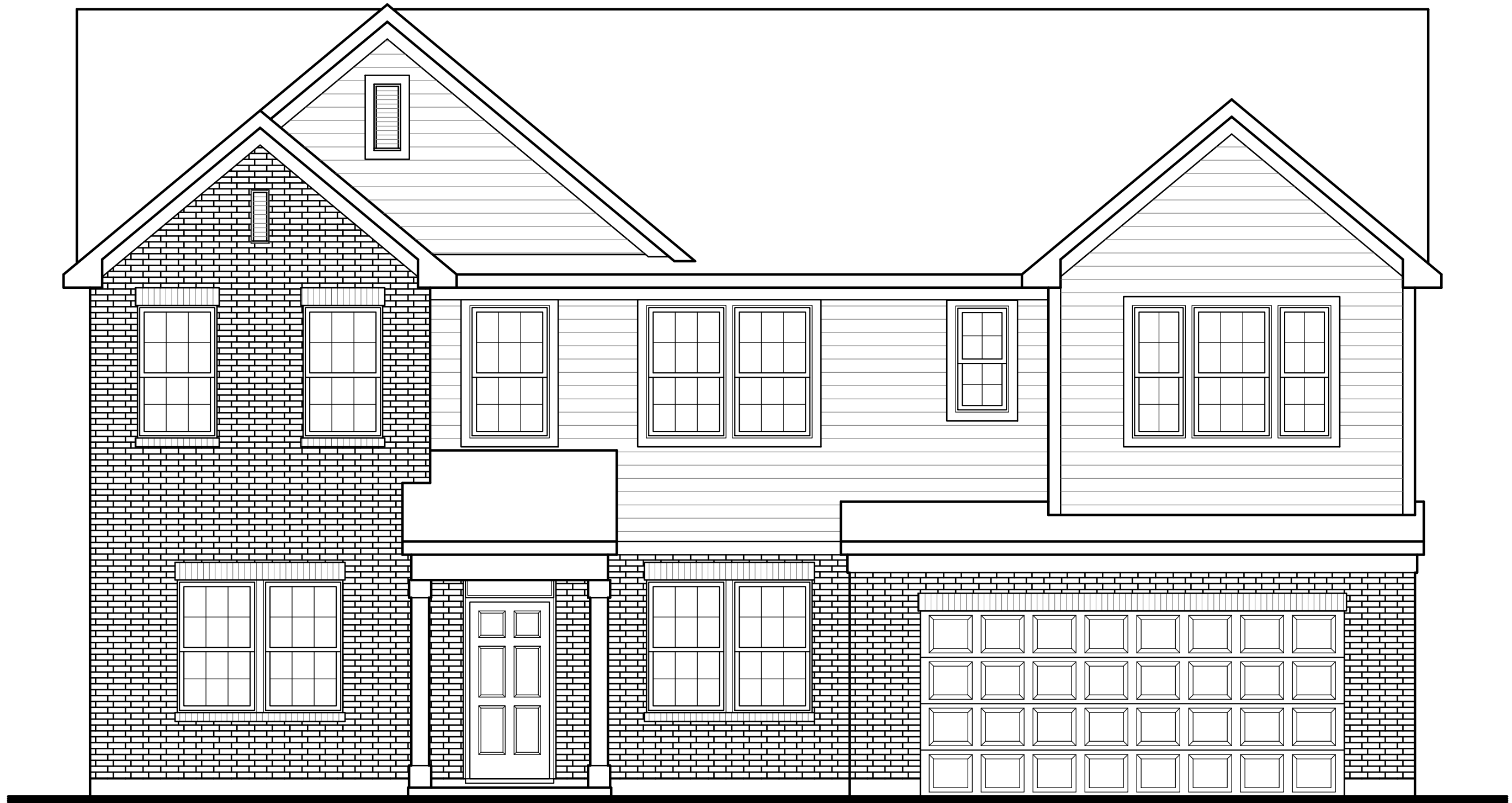
ALBRIGHT "E" TRADITIONAL