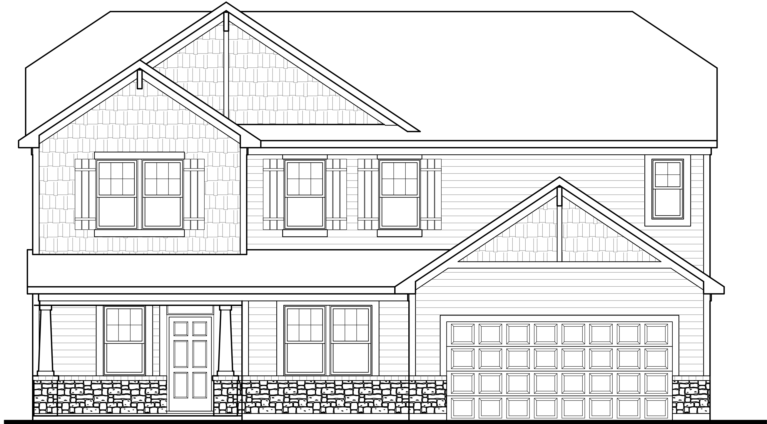
PATTERSON "D" CRAFTSMAN