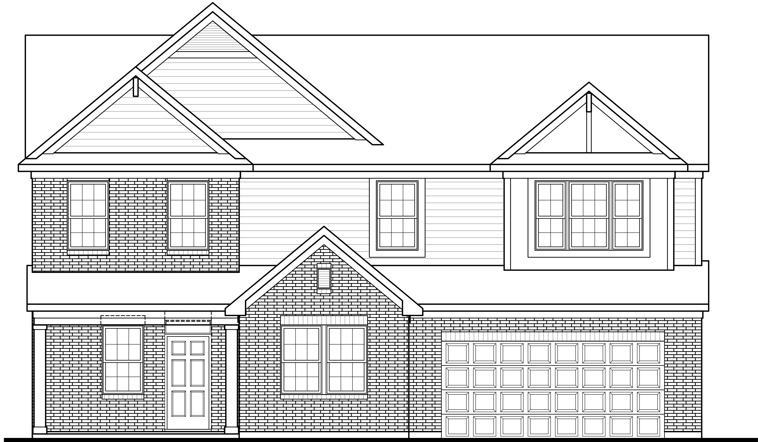
PATTERSON "E" TRADITIONAL