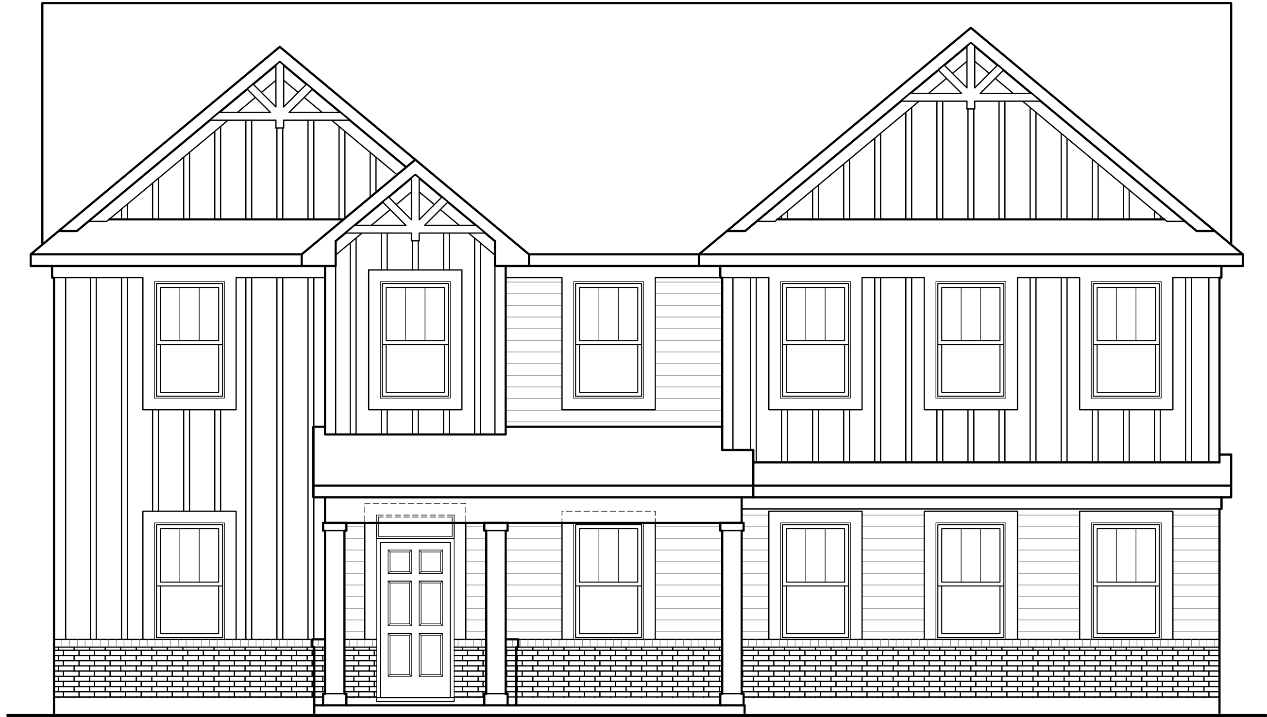
DICKINSON "C" FARMHOUSE SIDELOAD GARAGE