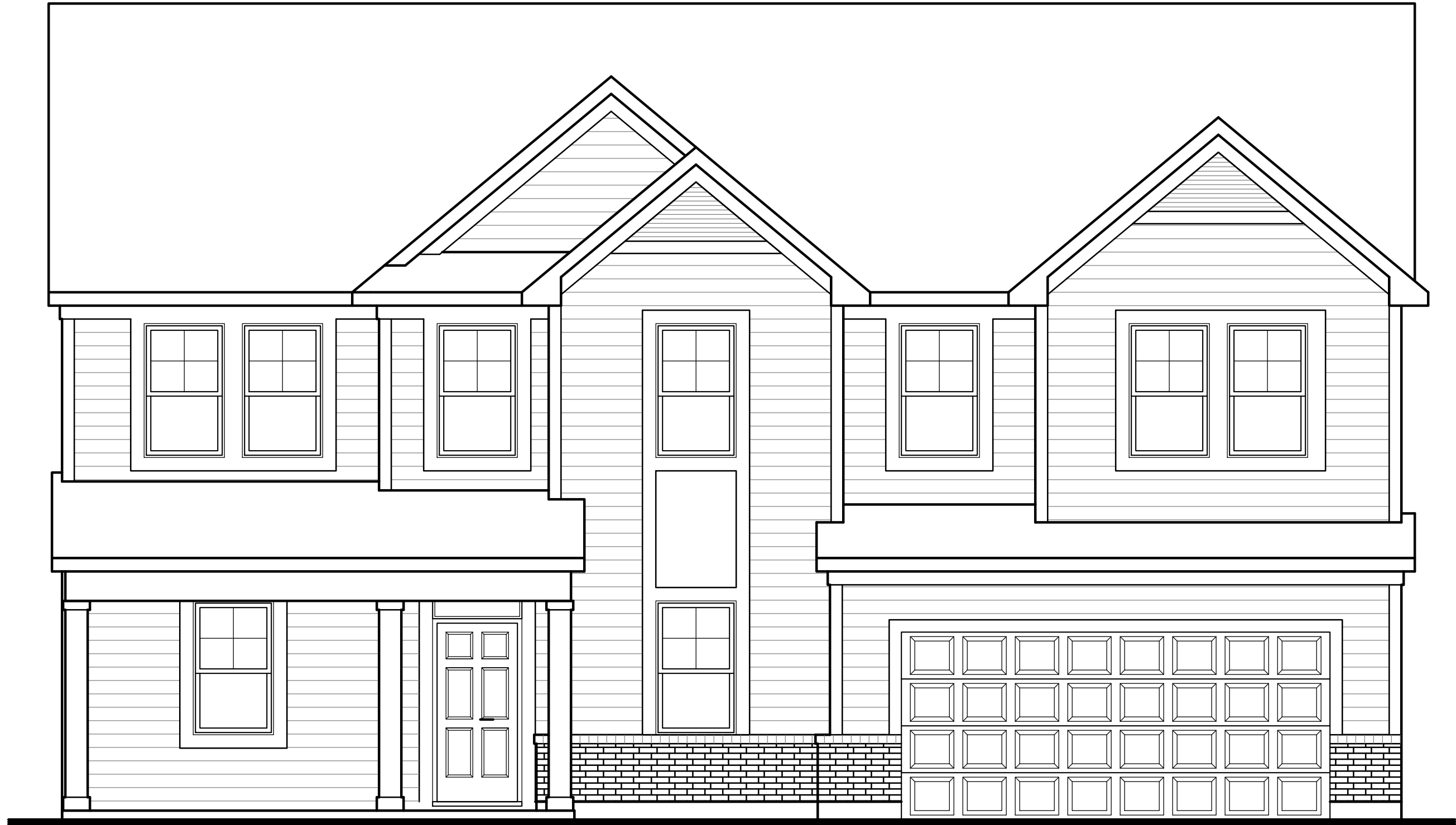
DICKINSON "B" FARMHOUSE