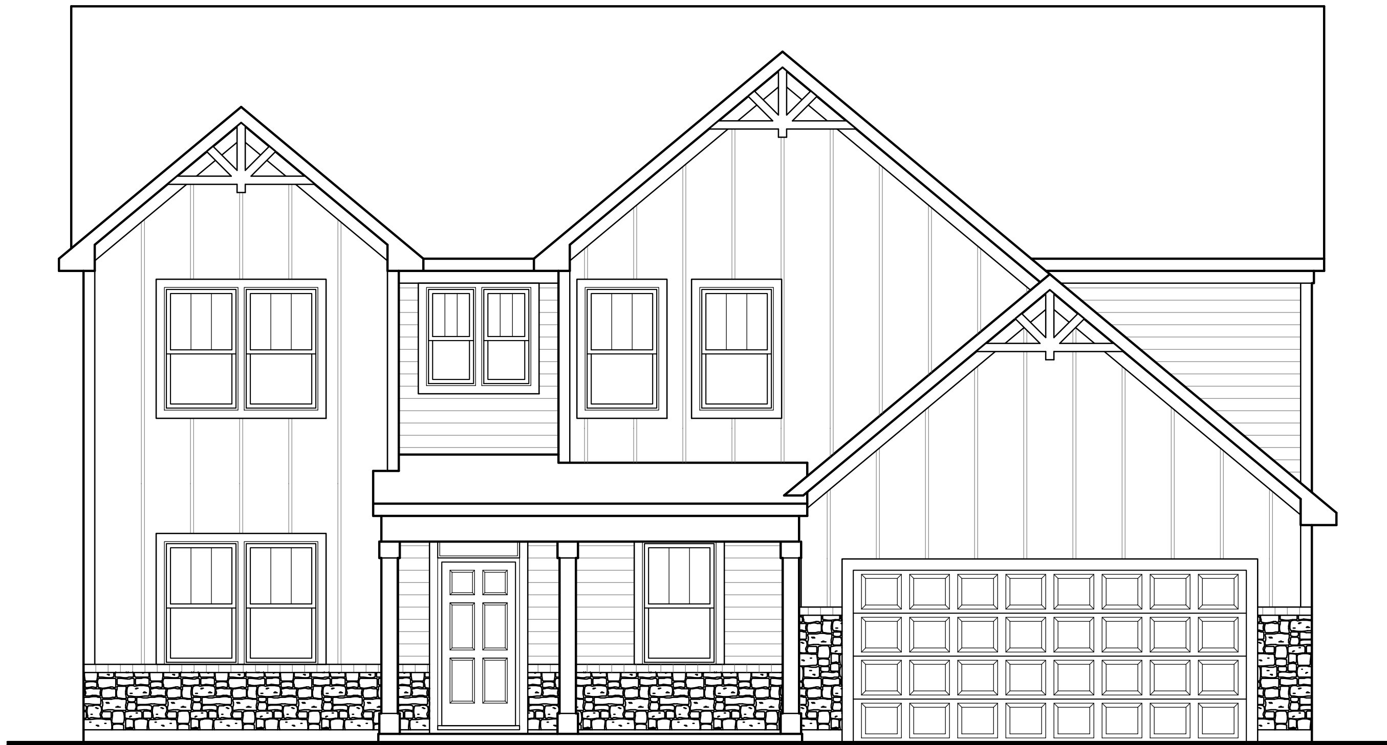
ALBRIGHT "C" FARMHOUSE