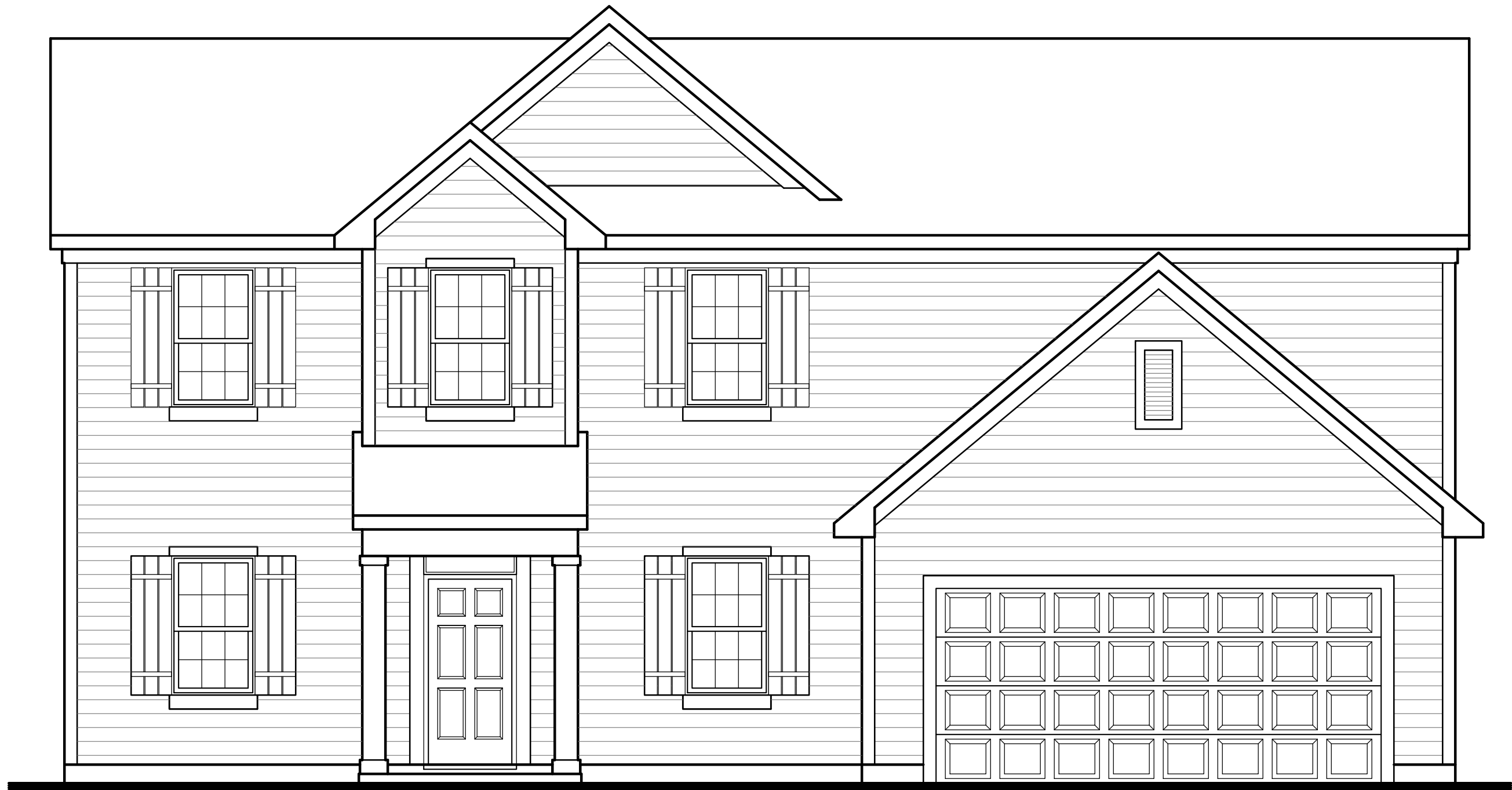
BRISTOL "A" TRADITIONAL