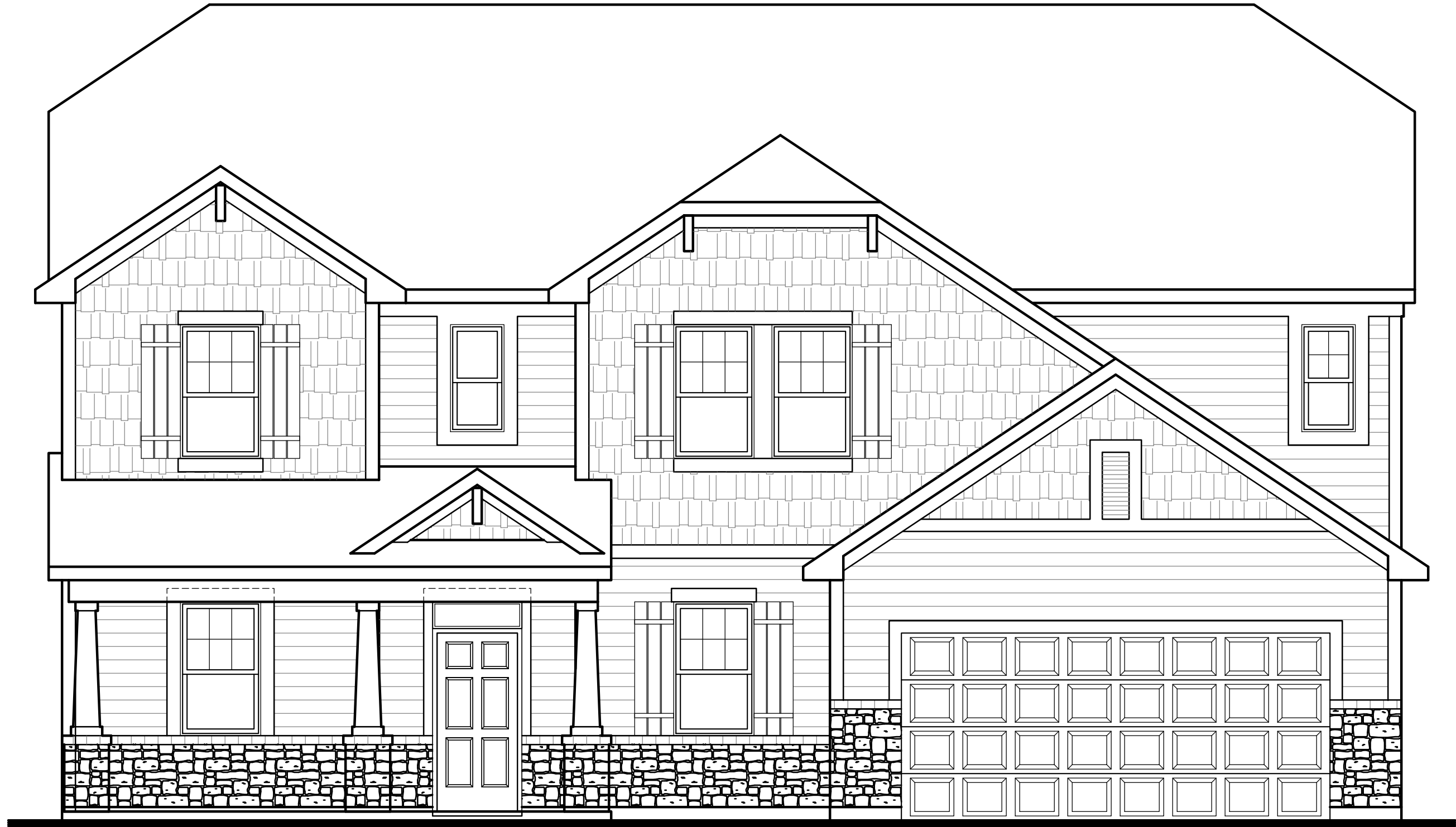
DICKINSON "D" CRAFTSMAN