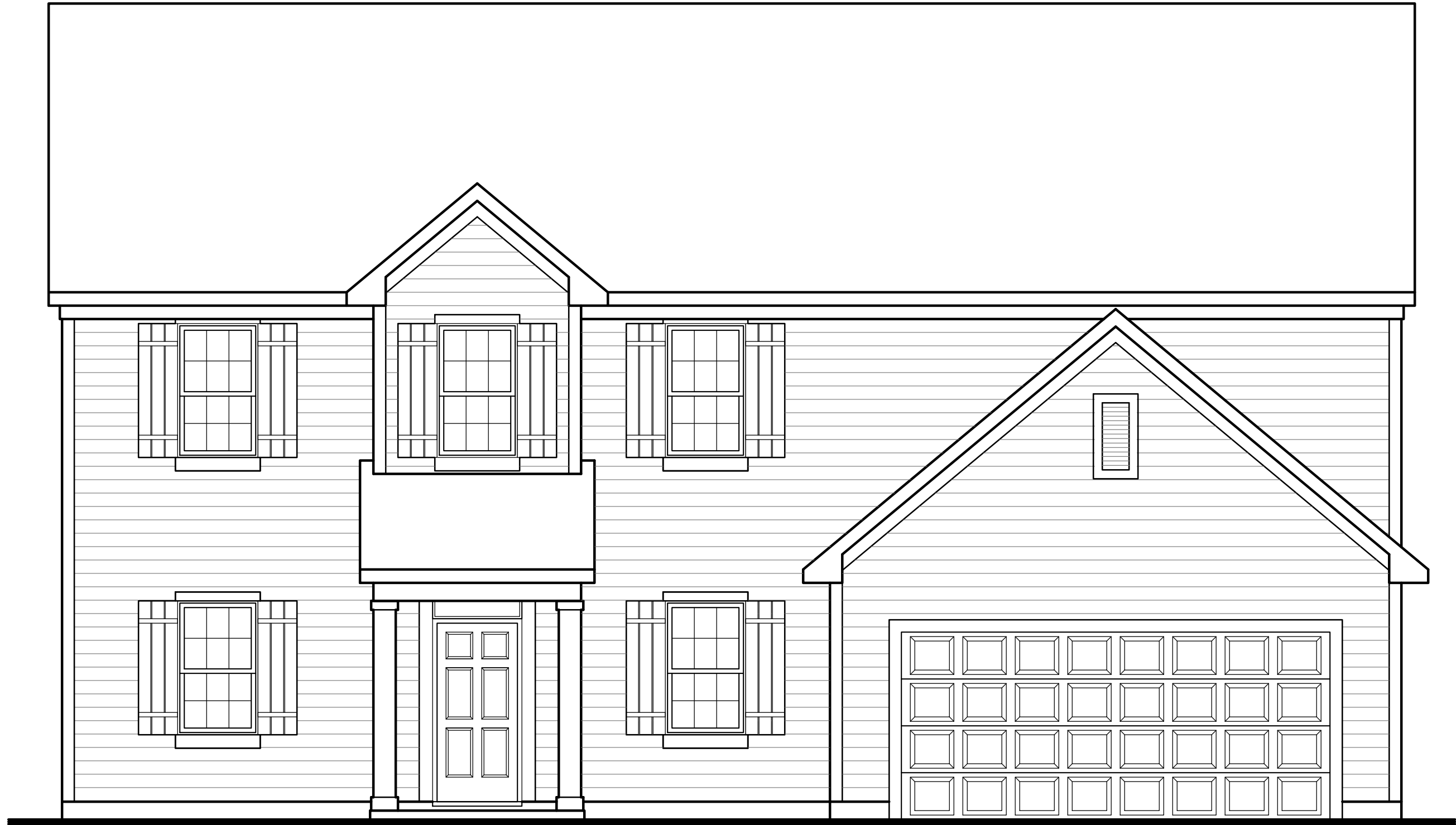
DICKINSON "A" TRADITIONAL