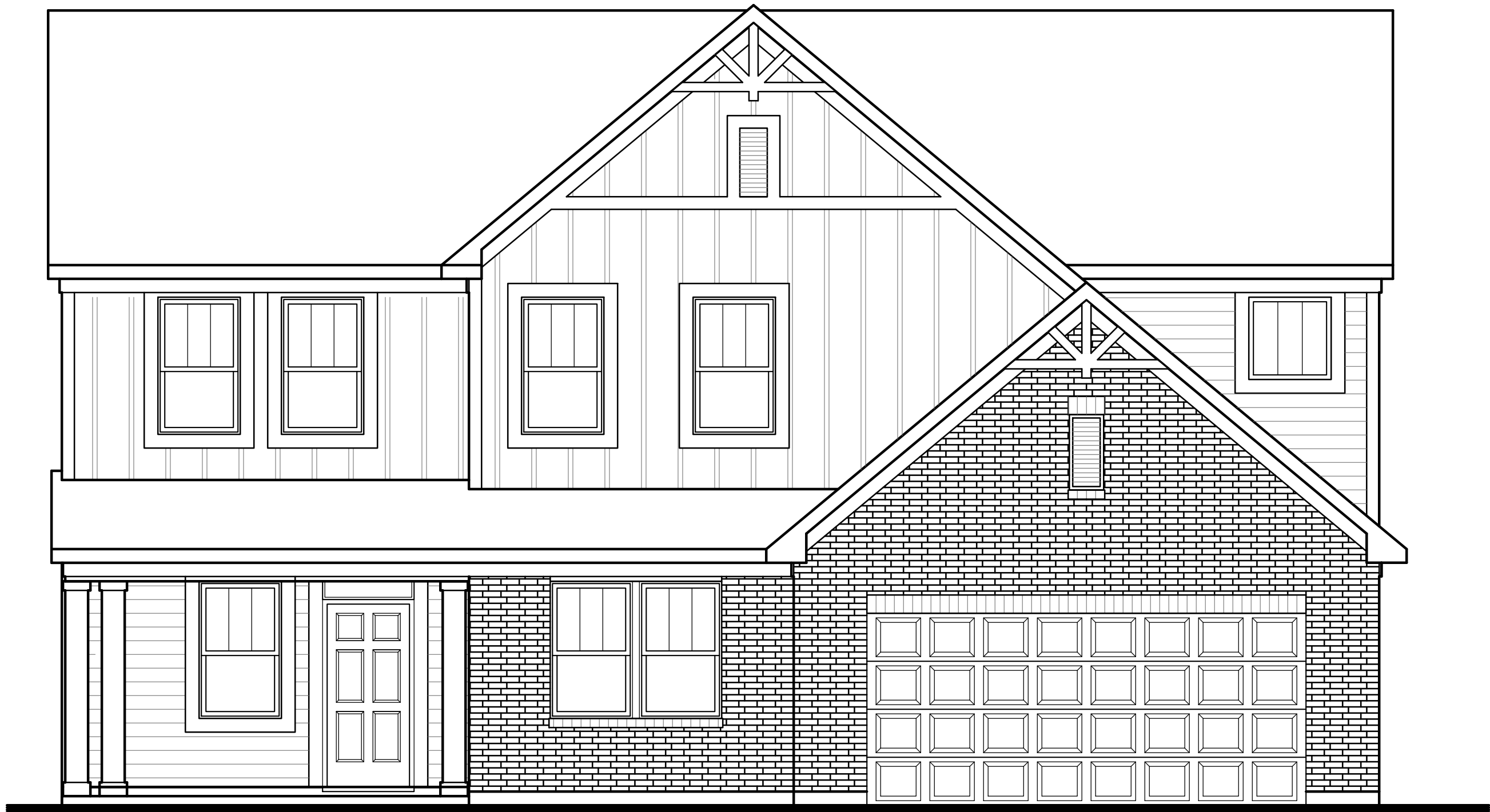
PATTERSON "C" FARMHOUSE