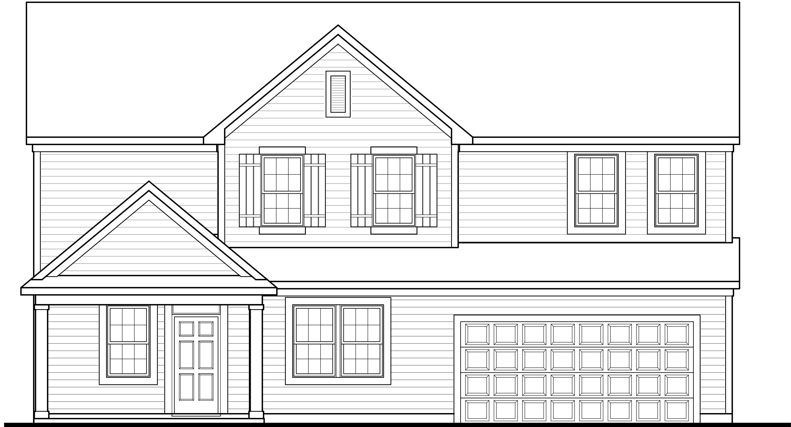
PATTERSON "A" TRADITIONAL