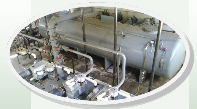
Wastewater Collections System Meadow Creek Vacuum Station #2 Meadow Creek Church Rd Locust NC