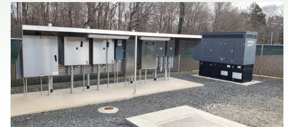
Wastewater Collections System Town Center North Lift Station #11 Kerri Dawn Ln Locust NC